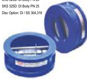
Dual Plate Check Valve Size : 1-1/2" to 24"

SKS 310D: CI Body PN 16 SKS 320D: DI Body PN 20 SKS 325D: DI Body PN 25 Disc Option: DI / SS 304,316