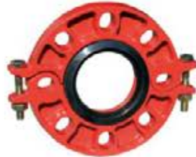
SKS GF 321