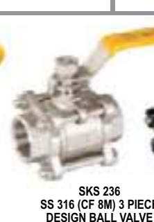
SKS 236 SS 316 (CF 8M) 3 PIECE DESIGN BALL VALVE