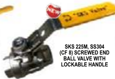
SKS 225M, SS304 (CF 8) SCREWED END BALL VALVE WITH LOCKABLE HANDLE