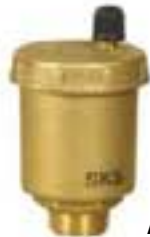
SKS 200 Automatic Air-Vent