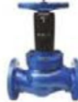
SKS 130 C.I. Balancing Valves Flanged Ends PN16