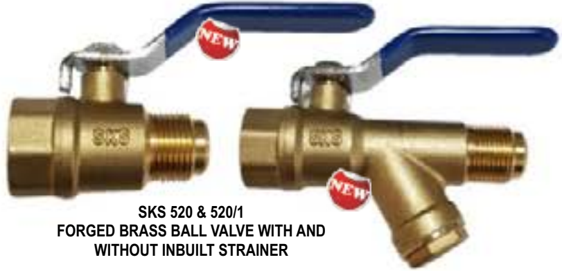
SKS 520 & 520/1 FORGED BRASS BALL VALVE WITH AND WITHOUT INBUILT STRAINER