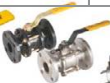
SKS 220, 240 & 246 CS / SS Ball Valve