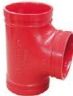
SKS GF 131