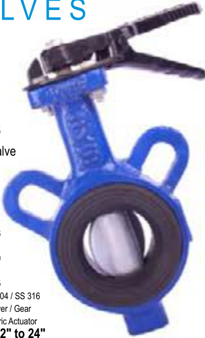
SKS 116EEA Butterfly Valve with Electric Actuator

SKS 116EL : CI Body PN 16 SKS 117EL : DI Body PN 20 SKS 118EL : DI Body PN 25 Disc: DI / SS 304 / SS 316 Actuator : Lever / Gear Manual / Electric Actuator Size : 1-1/2" to 24"