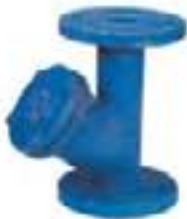
SKS 274 CI Y Strainer