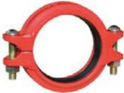
SKS GF 1GS