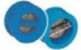
SKS 310D Dual Plate NRV