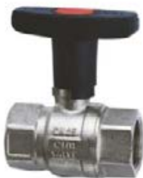
Forged Brass Full Bore Ball Valve with Extended Stem Nylon Handle PN 32 Size : 1/2" to 1"