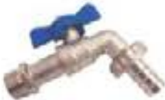
SKS 534 Forged Brass Bib Cock