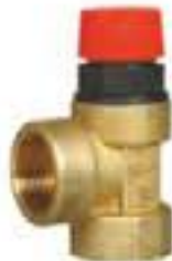
SKS 910 Safety Valve