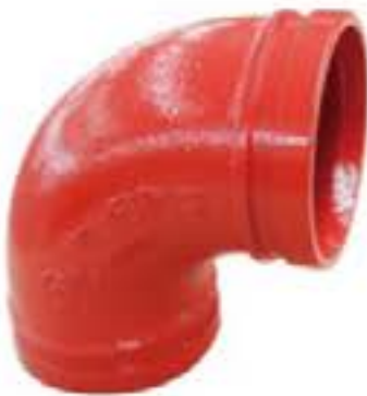
SKS GF 90