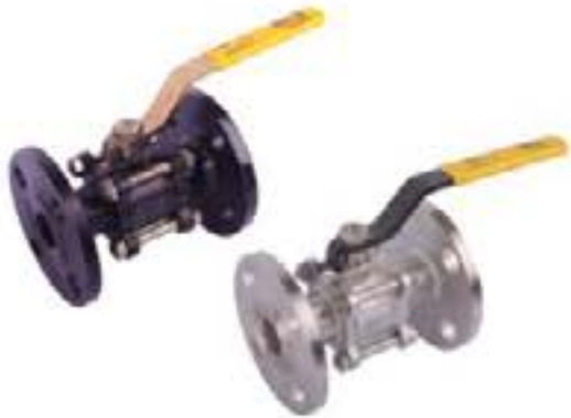
SKS 220: CS Body SS 304 Ball SKS 240: SS 304 Body SS 304 Ball SKS 246: SS 316 Body SS 316 Ball SKS 220/240/246