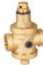
SKS 143 PRV PN25