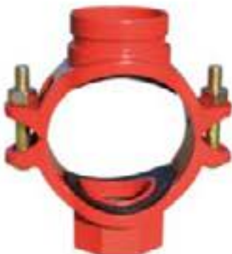
SKS GF 3J