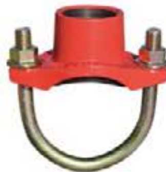
SKS GF 3L