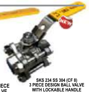
SKS 234 SS 304 (CF 8) 3 PIECE DESIGN BALL VALVE WITH LOCKABLE HANDLE