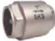
SKS 530 Forged Mini Check Valve