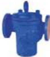
SKS CI 274 PCI Pot Strainer - Flanged