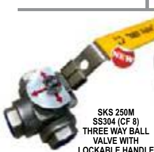
SKS 250M SS304 (CF 8) THREE WAY BALL VALVE WITH LOCKABLE HANDLE