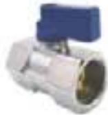
SKS 511 Forged Mini Ball Valve