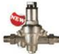
SKS V-1 Forged Brass Pressure Reducing Valves PN25 with Inbuilt Strainer