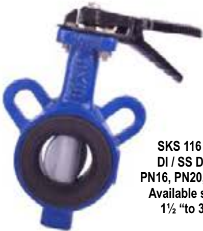
SKS 116 EL DI / SS Disc PN16, PN20, PN25 Available sizes 1½ "to 30"