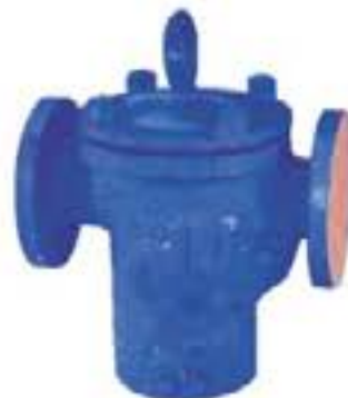
CI / MS Body POT Strainer - Flanged Size : 1-5" to 16"