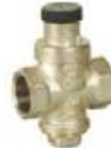
SKS 102 PRV PN10