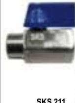
SKS 211MF One Side Male X One Side Female Ends