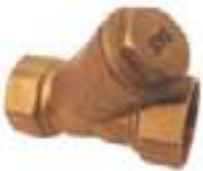
SKS 574 Forged Brass 'Y' Strainer