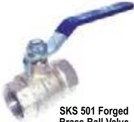
SKS 501 Forged Brass Ball Valve